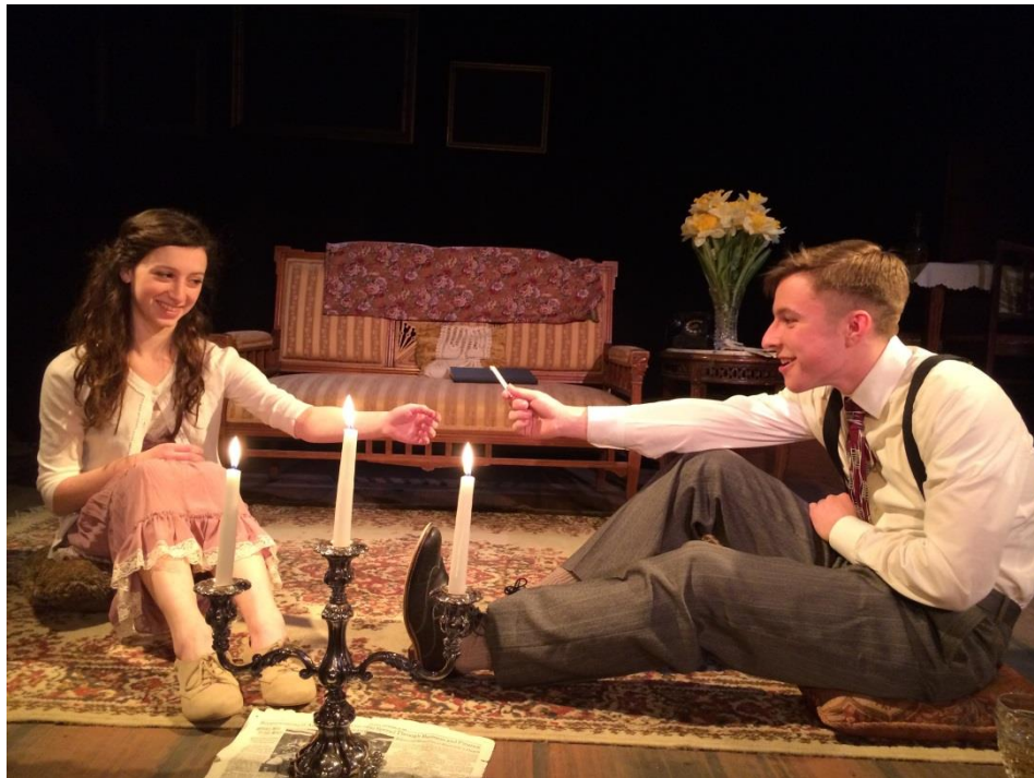
(The Glass Menagerie- FHS Black Box 2014)