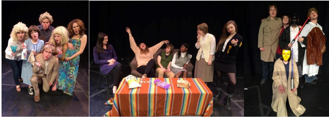
(Day of One Acts FHS PAC 2014)